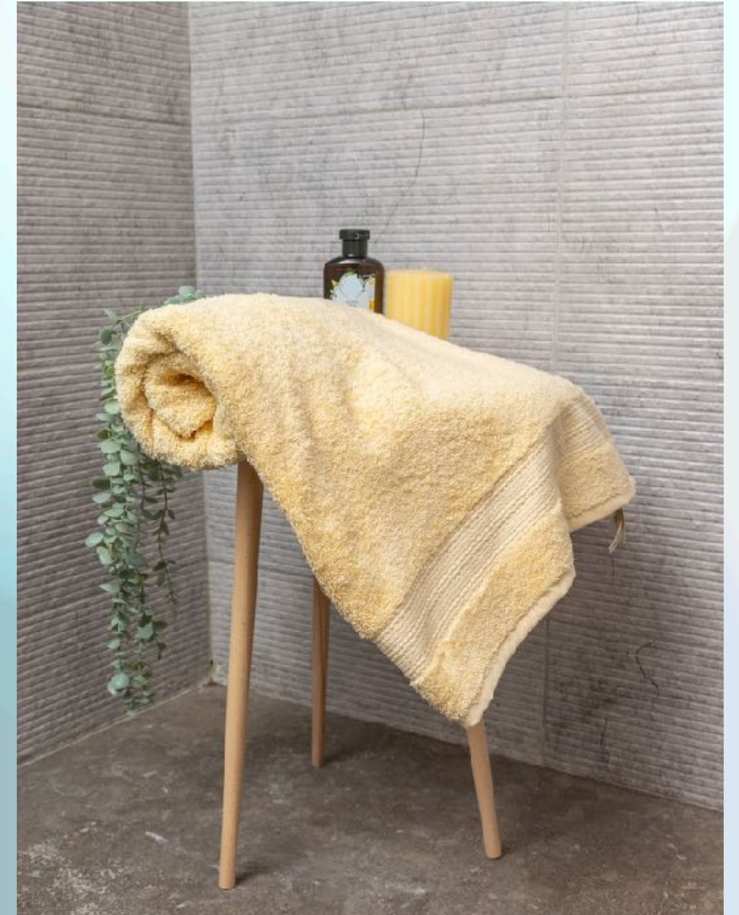
Bath Sheet High Loop Towel